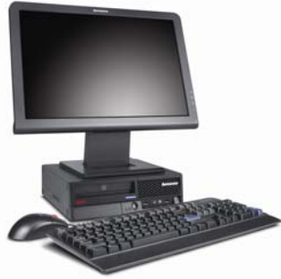
Lenovo's ThinkCentre A61e