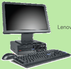
Lenovo's ThinkCentre A61e